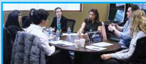
The Heidner Properties Team

This year's program offered career exploration in three fields: manufacturing, business, and early childhood education. The program served 30 students; 10 in each field. The manufacturing group toured area manufacturers, and learned production line runs by creating two products. The business group was divided into two teams. The first worked with Heidner Properties to devise a marketing plan for Gigi's Café; the second worked with Fiesta Market to develop a solution to parking and circulation at the store. The early childhood group was also divided into two teams, both working with Streamwood Park District on the development of summer programs and lesson plans.