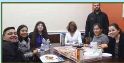
The Fiesta Market Business Team

The first year focused on manufacturing businesses, and promoted the concept of 'white collar manufacturing.' The second year expanded to include education options, programming, and certifications at Elgin Community College. Last year, the program shifted focus with 15 students working with local retail businesses. Students were presented with real life business concerns, and had to work with area businesses to craft workable solutions.