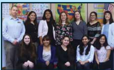
The Early Education Team

Join us on May 1 as students take over the town! Student Government Day gives high school seniors an opportunity to understand how local government works. Students will run a mock Board Meeting at 7:00 pm at Village Hall.