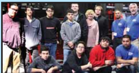
The Manufacturing Team

School District U-46 students participated for the fourth year in the Streamwood Career Exploration Program (SCEP). The program, which ran during March 2018 spring break, allowed high school students to get involved with the businesses in our community. Students learned about career options and blended what they've learned in the classroom to real-world scenarios in business.