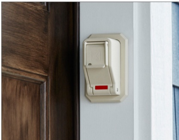
Figure 2: Permanent mount.

A Knox Box is a secure, locked case to place a key for access into your home by the Fire Department. If you have a medical emergency and are unable to unlock your door after calling 911, a Knox Box key lets the Fire Department unlock your door with the key that you provided. Without a Knox Box, the Fire Department may have to gain access to your house by force. Only your Fire Department has the key that can unlock your Knox Box. The Knox Box can be temporarily hung over a door or it can be permanently mounted to the building. The program consists of a $50 deposit when initially renting the box. When the box is returned, the deposit is returned. Please contact the Fire Department at (630) 736-3650 for more information.