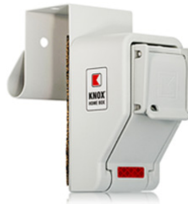
Figure 3: Standard over the door.